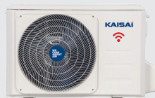
Outdoor unit KRX