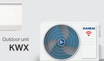
Outdoor unit KWX