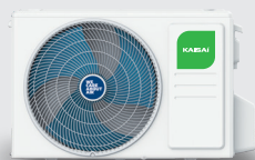
Outdoor unit KWX