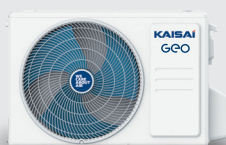
Outdoor unit KGE