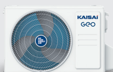
Outdoor unit KGE