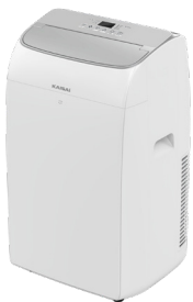
Indoor unit KKPE-12PTA1