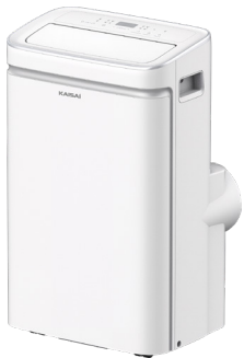
Indoor unit KKPM-12PRA1