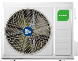
Outdoor unit KKOK